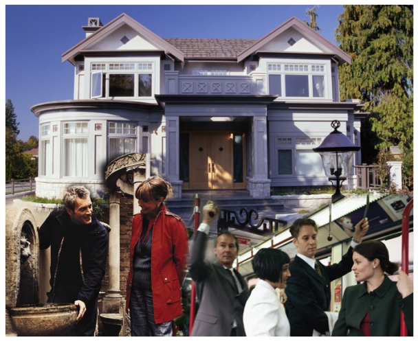
Urban Commuter Families

With more than nine times the national average for farmers, America's Farmlands has the highest percentage of farmers in the nation. In these remote communities scattered across the nation, residents are likely to have high school diplomas and middle-class incomes. Many live in older, single-family homes on large plots of land. The population density in this segment is less than one-tenth the national average.