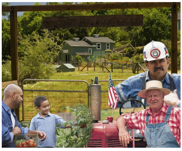
Coal and Crops

With more than nine times the national average for farmers, America's Farmlands has the highest percentage of farmers in the nation. In these remote communities scattered across the nation, residents are likely to have high school diplomas and middle-class incomes. Many live in older, single-family homes on large plots of land. The population density in this segment is less than one-tenth the national average.