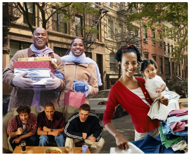
Minority Metro Communities

With more than nine times the national average for farmers, America's Farmlands has the highest percentage of farmers in the nation. In these remote communities scattered across the nation, residents are likely to have high school diplomas and middle-class incomes. Many live in older, single-family homes on large plots of land. The population density in this segment is less than one-tenth the national average.