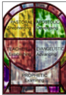
APEPT Missionality™ is based upon Ephesians 4:11-12

TAKE THE APEPT SURVEY ONLINE www.apept.org