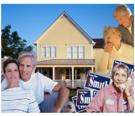
UNREACHED ARCHIE & EDITH

A quietly aging cluster, Steadfast Conservatives is home to mature singles and couples living in midscale urban neighborhoods. Households tend to be white, high schooleducated and middle class. Many have begun to empty-nest or are already filled with couples and singles aged 65 years or older. The seniority of many residents does have