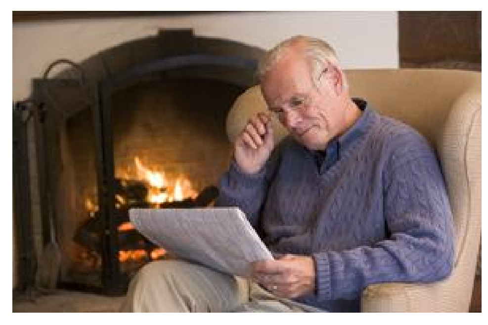
But I already paid my dues to Heaven on Sunday!