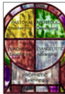
APEPT Missionalilty™ is based upon Ephesians 4:11-12

The APEPT missional roles are: Apostolic, Prophetic, Evangelistic, Pastoral and Teaching. It will take all of these roles working together in order to reach Professional Urbanites in Zip 48304