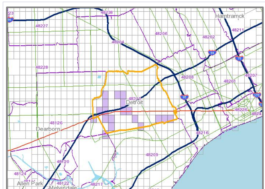
Map produced by MissionalCulturescape.org in association with InteractiveGIS.com.

Location of K05, New Generation Activists households in zip code 48210 in Detroit, Michigan