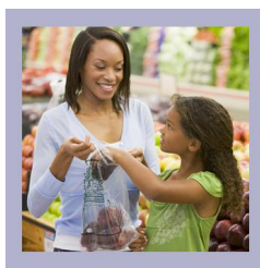
Consumer patterns provide opportunities for developing redemptive relationships

with these kind of people; or may also be a barrier to their understanding or acceptance of Christ.