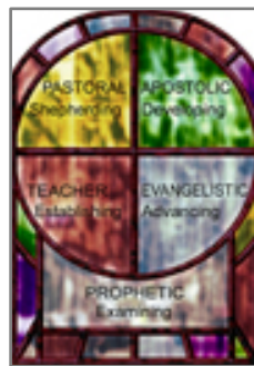
APEPT Missionality™ is based upon Ephesians 4:11-12

The APEPT missional roles are: Apostolic, Prophetic, Evangelistic, Pastoral and Teaching. It will take all of these roles working together in order to reach Struggling City Centers in Zip 48203