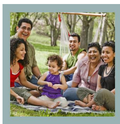
Consumer patterns provide opportunities for developing redemptive relationships

with these kind of people; or may also be a barrier to their understanding or acceptance of Christ.