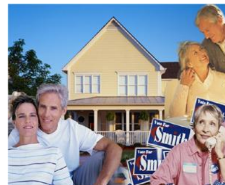
UNREACHED ARCHIE & EDITH

A quietly aging cluster, Steadfast Conservatives is home to mature singles and couples living in midscale urban neighborhoods. Households tend to be white, high school-educated and middle class. Many have begun to empty-nest or are already filled with couples and singles aged 65 years or older. The seniority of many residents does have