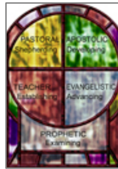
APEPT Missionalilty™ is based upon Ephesians 4:11-12

The APEPT missional roles are: Apostolic, Prophetic, Evangelistic, Pastoral and Teaching. It will take all of these roles working together in order to reach Steadfast Conservatives in Zip 49709