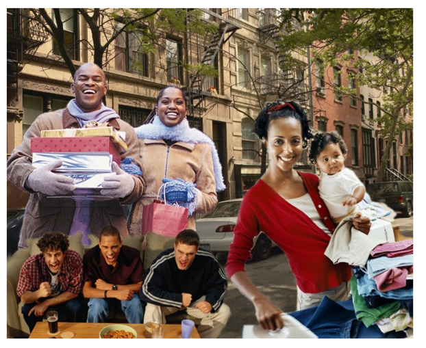
Minority Metro Communities Households: 123 Percent: 31.54% Unreached: 74%

Struggling City Centers consists of very low-income households living in city neighborhoods. Home to the highest concentration of African-Americans in the nation-nearly 90 percent of all households-the cluster faces hard economic challenges. One-third of households haven't finished high school, with a similar percentage containing single-parent families. One in five adults are under 35 years old and the median household income is only half the national average.