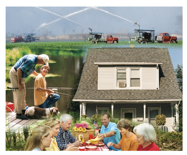
Hardy Rural Families